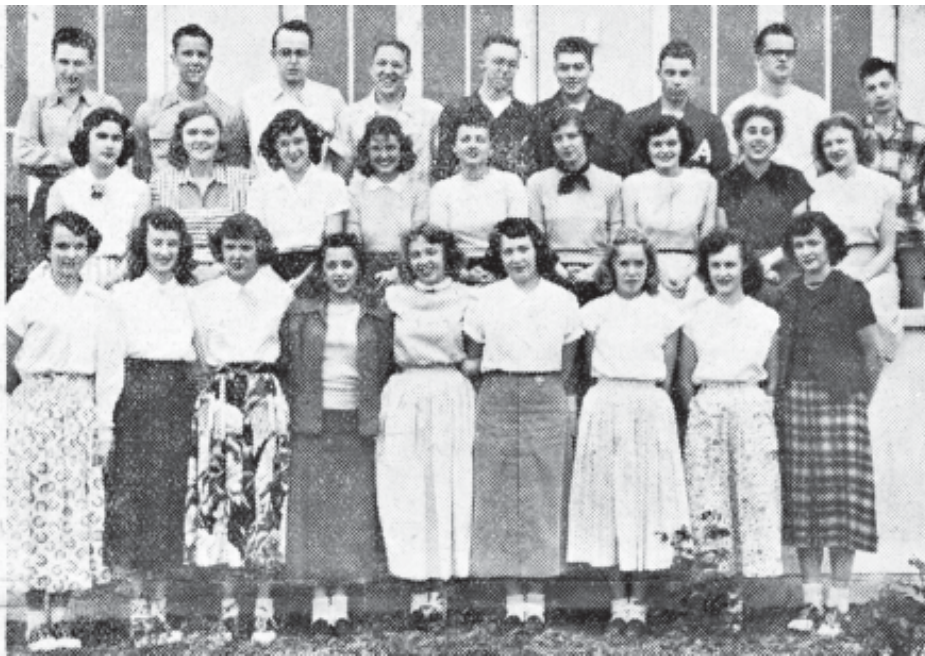
The Graduating Class of 1952