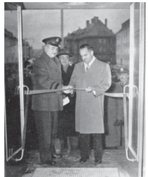
Cutting the ribbon at the new school – yearbook photo