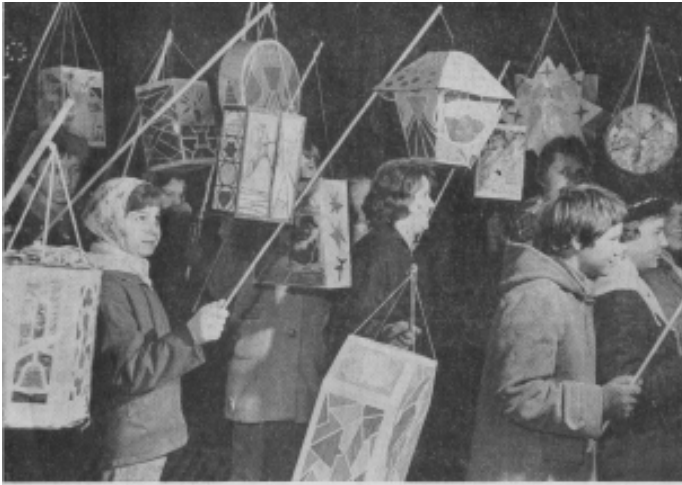
A group of children in the long parade proudly carry their self-made colored lanterns.