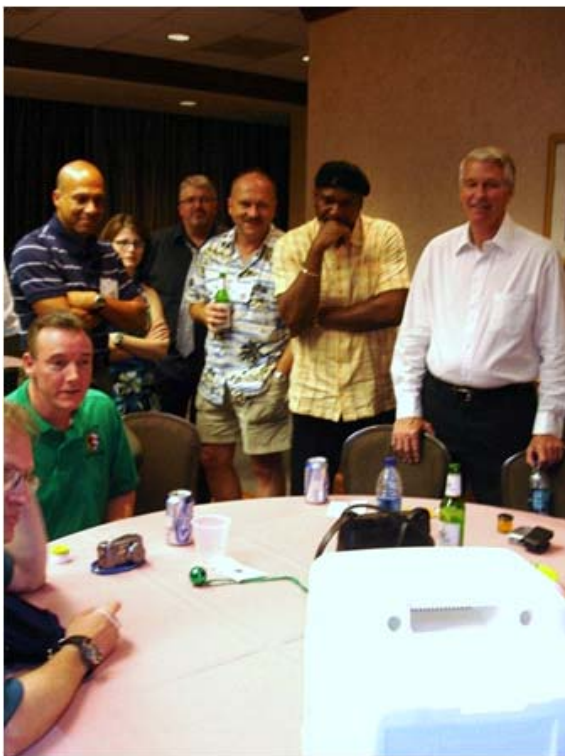
Identifications welcomed. Anyone?