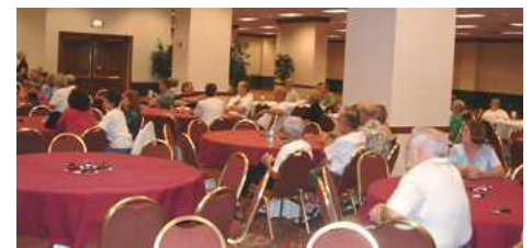
General Business Meeting, June 20, 2008

At the General Business Meeting the next day, no nominations were heard from the floor so the Board agreed to continue for three more years.