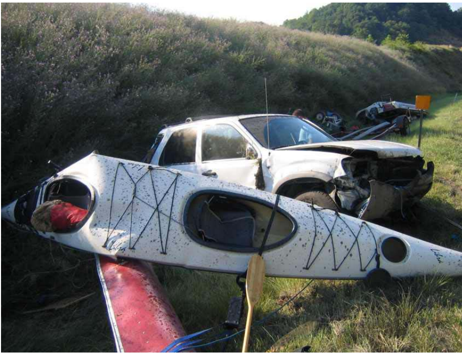
The remains of Alan's car and trailer