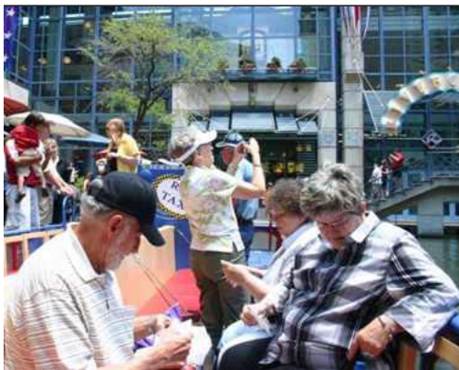
Alumni on the River boat ride