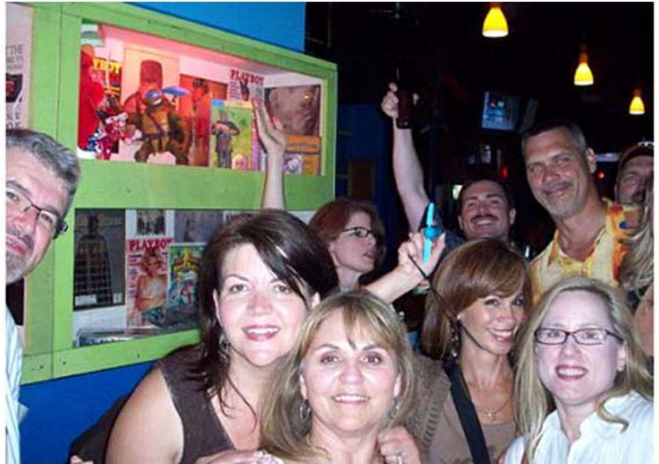
Identifications welcomed. Anyone?