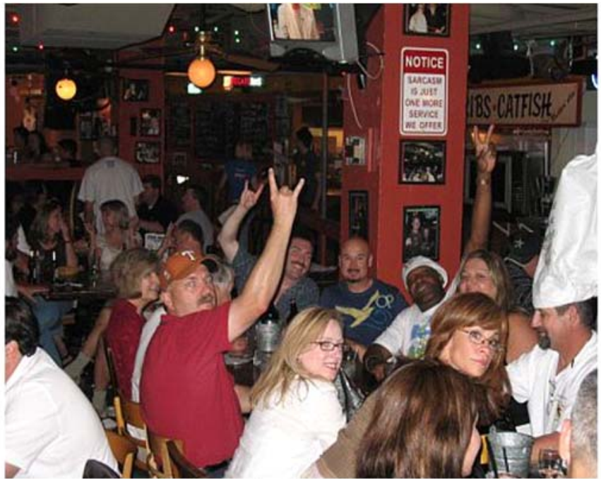
Identifications welcomed. Anyone?

The next reunion site is currently being contemplated. This gathering of Eagles will be on the West Coast and Boise is one of three preliminary options. Since most Eagles like to hang around with each other for the precious 4 or 5 days that we meet every three years, large tourist sites are not a necessity. Boise is a small town with great climate and welcoming hospitality. The site selection team is busy working on additional options for the Board members to vote on, lodging and flight costs being the number one factor in selecting a site. We want the reunion to be as affordable as possible so that you all can attend. More importantly...plan on attending. You won't regret it.