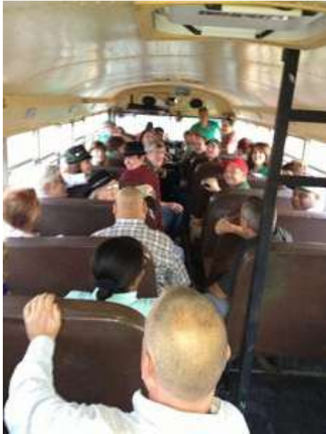
We found a bus! Off to the Wursthfest!