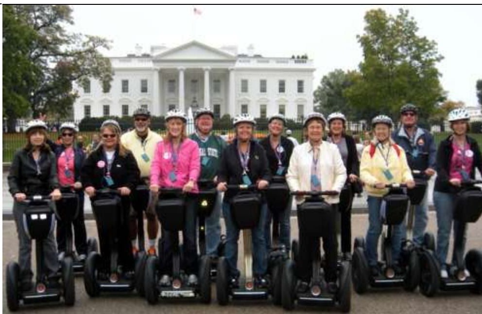
The Overseas Brats group touring DC on Segways

P. S. A belated happy Veterans' Day salute to all of my fellow vets out there. THANKS for serving your country, and WELCOME HOME!