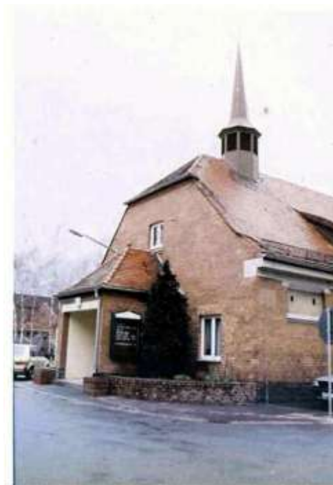
The Kaserne Chapel