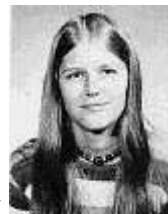
1975 Annual Picture