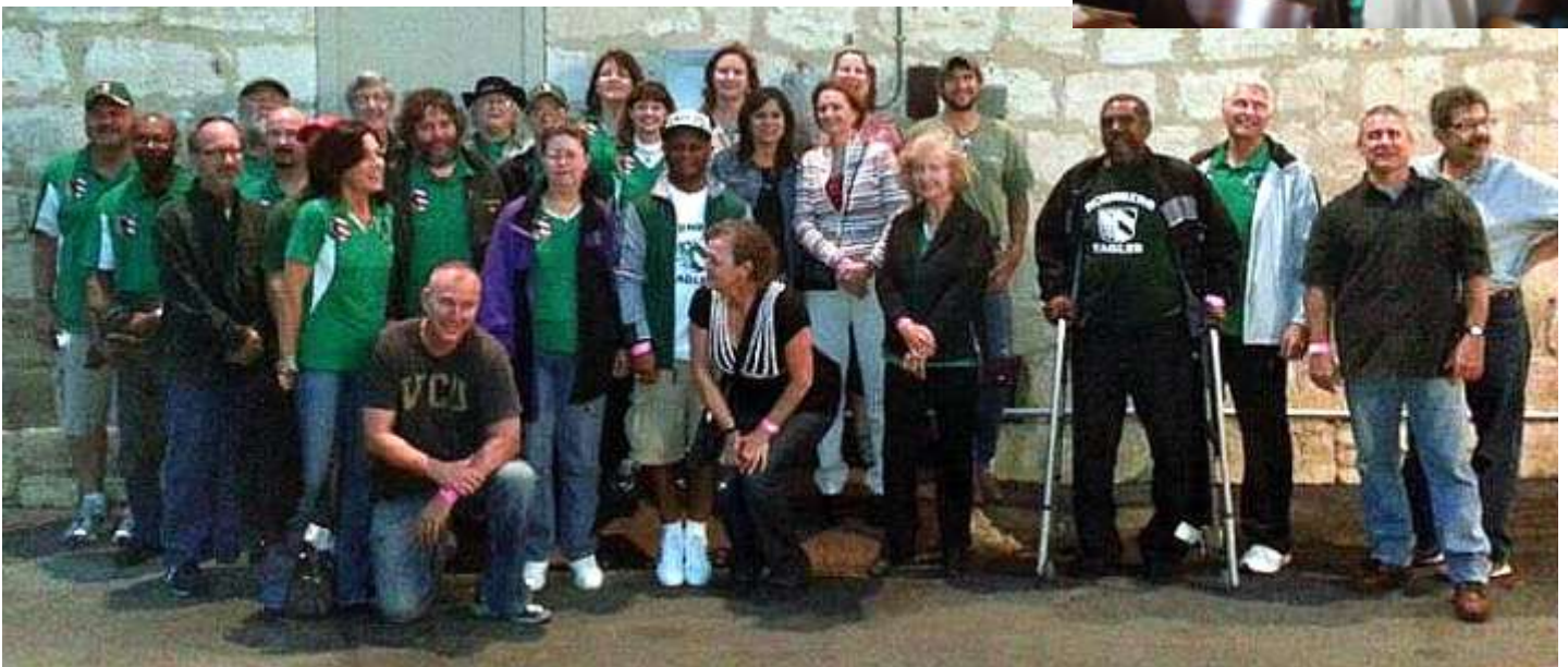
Well, I had a list of everyone who was there but the spilled beer made the ink run!