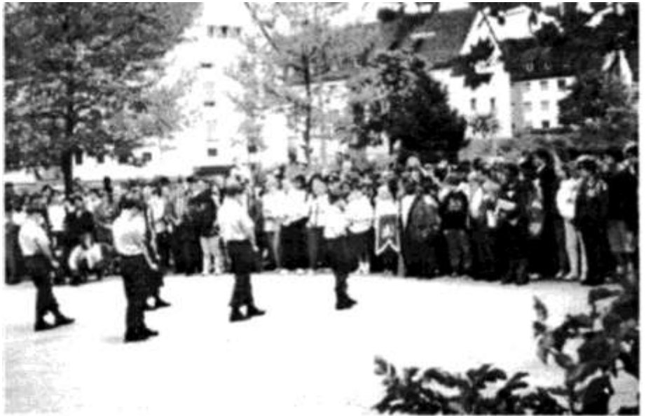
JROTC Drill Team performing at the closing ceremony

One thanked his father for taking away his driver’s license so he would study. Another thanked a younger