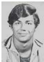
1975 Annual Picture