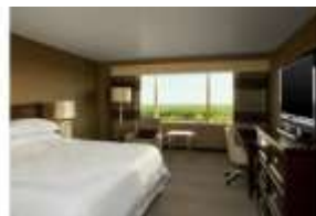
A typical room