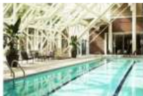
The indoor-outdoor pool