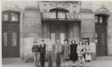
Students on the club council pose in front of the Fürth Opera House, site of short-lived teen club

As of now, the Juniors are saying nothing about the present war between