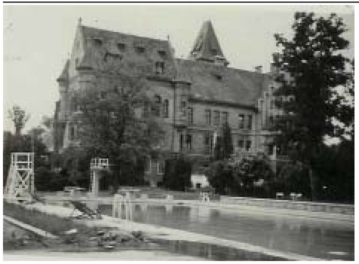
Stein Castle and Pool