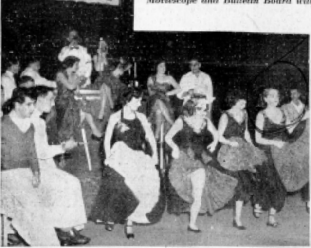
Shapely legs flashed in the "Bowery" sequence of "Rhapsody in Rhythm". The boys look a little warm out here—quite willing to let the ladies have the exercise, for a chang.

This week we are omitting the usual features found on page six. Instead, we have arranged a picture page centering around the current soldier show production "Rhapwody in Rhythm". Vagabond Corner, Did You Know, Moviescope and Bulletin Board will return in the April 1 issue.