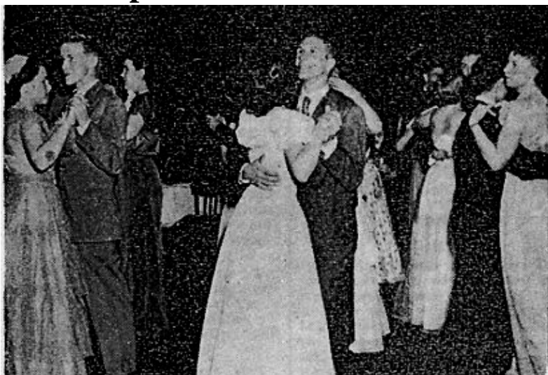
A glimpse of the junior-senior prom which was held at Stein Castle on June 2nd. Approximately 60 persons danced to the music of the Stein band.