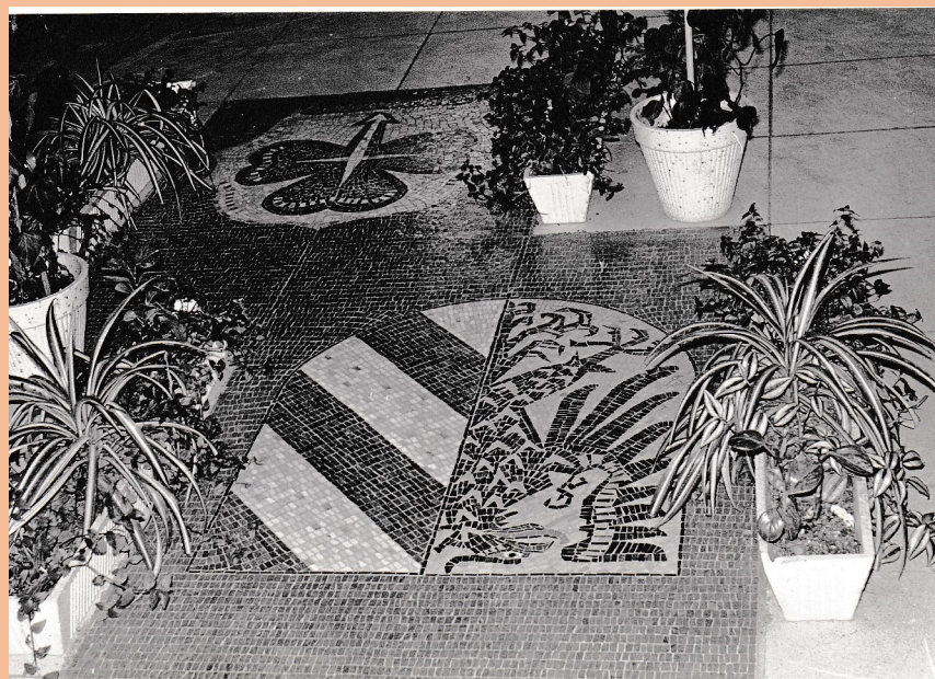
Mosaics on the floor of the main entrance to NHS depicting crests of Fürth (top left) and Nürnberg