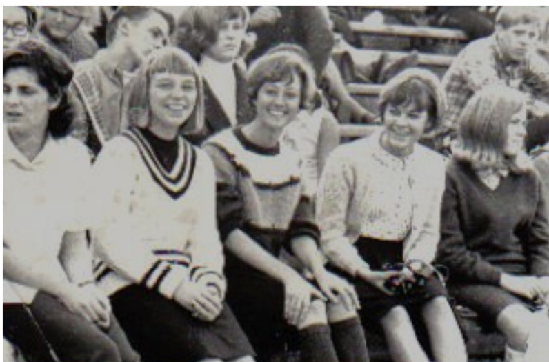
Avid Football Fans

Sorry, folks, there was nothing inside this folder. — Archivist