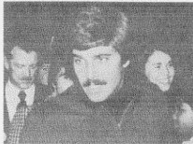
Mark Spitz, winner of seven gold medals at the Munich Olympics, is Guest of Honor at Herzo Base Sports Banquet

I speak from personal experience--I was an honest Jesus freak myself about a year ago. It was good for a while, till I saw the other side. -- an NHS Student