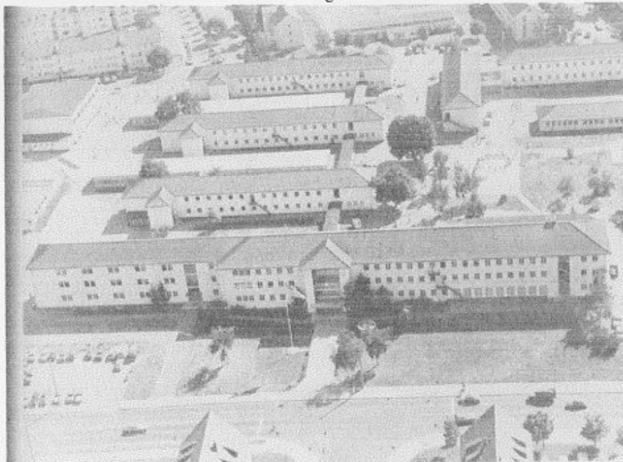
Unusual aerial view of the Nürnberg American schools in 1974, the high school, the junior high, the elementary school

Among the activities, there was bicycle riding, going to bullfights, visiting pearl factories, exploring caves, horseback riding, swimming on the beach or in hotel pools, and going to discos. Some people made their own fun by short-sheeting beds, falling off horses, having shaving cream fights, knocking on people's hotel doors at midnight, and just having a lot of fun together. -- Pam Rose.