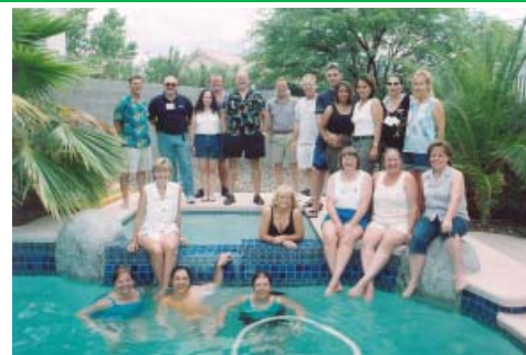
2002 — 6th reunion in Las Vegas. Pool party at the Flamingo Hilton. A record 639 came to this one.

Once again the officers from the previous term were re-elected. The empty 80s-90s rep position was filled in 2009 by Linda (Moreira) Langford, '80 .