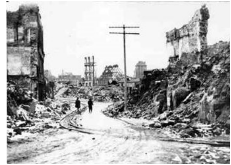
The Aftermath of War — The inner city of Nürnberg at the end of WW II .