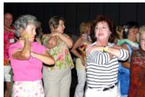
Doing the Macarena at Reunion No. 7 in Orlando, Fl.