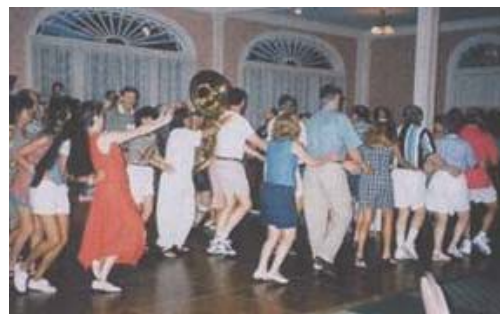
1990 — Doing the Bunny Hop at the 4th reunion in Clearwater Beach, FL. 225 attended.