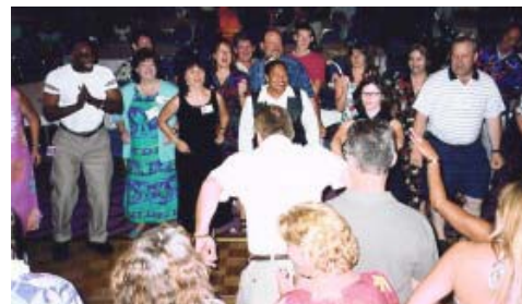
Talking to the Stroll in Vegas