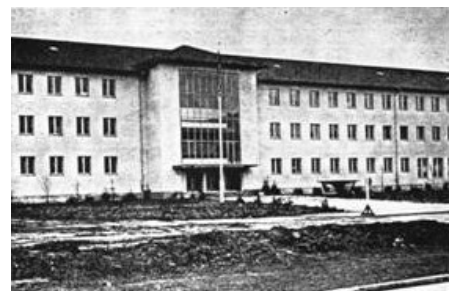
1952 — The new NHS on 30 Fronmüllerstrasse