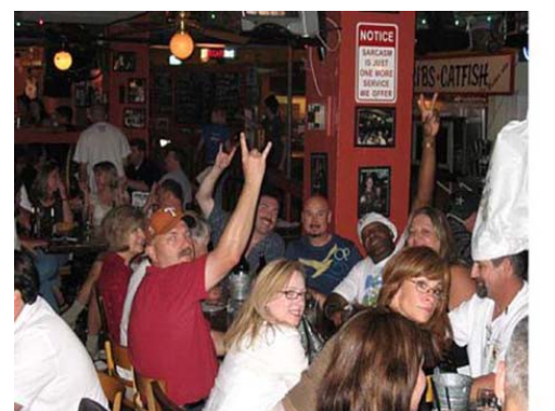
Reunion No. 8 in San Antonio, TX. A bunch of the boys whooping it up on the Riverwalk