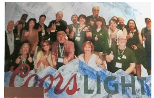
And a good time was had by all in Golden!