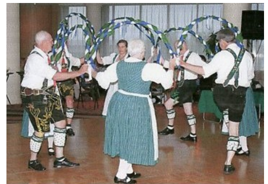
German folk dancers entertain the D.C. visitors