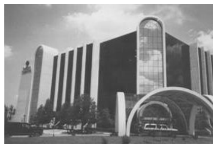
1990 — Radison Suite Hotel in Arlington, TX, site of the 2nd reunion. 238 attended.