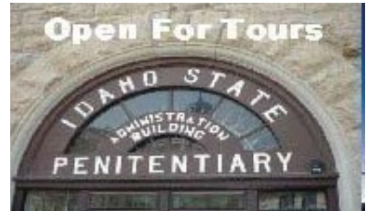
A good place to visit, but you wouldn't want to live there.