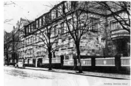
1947 — Nürnberg American High School at No. 19 Tannenstrasse