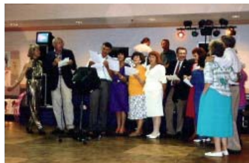
1993 — Eagles gather at Lake Tahoe, CA, for the 3rd reunion. Everybody got into the act on Karaoke Night. 336 attended.